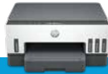
Smart Tank 7000