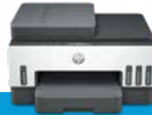
Smart Tank 7300