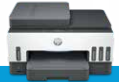
Smart Tank 7600