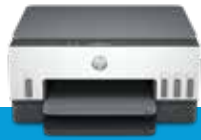
Smart Tank 6000