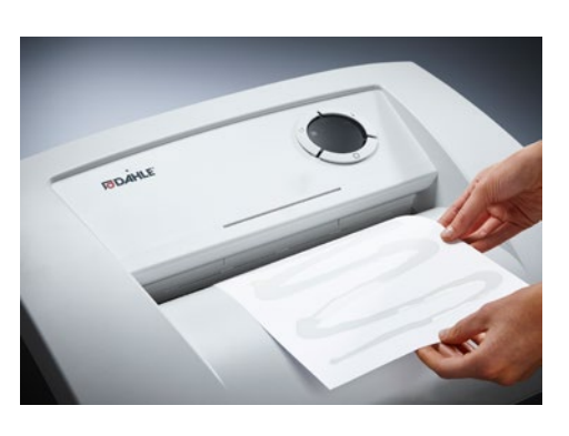
Dahle Office 410 L plus document shredder