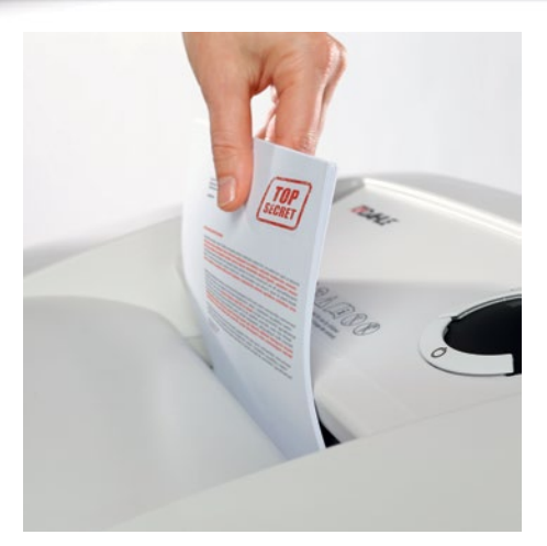
Innovative MHP technology® shreds up to 30 % more paper