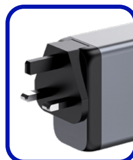
UK Type G