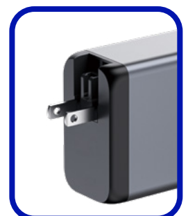
US Type A