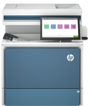
HP Color LaserJet Enterprise Flow MFP 5800zf Printer

This printer is intended to work only with cartridges that have a new or reused HP chip, and it uses dynamic security measures to block cartridges using a non-HP chip. Periodic firmware updates will maintain the effectiveness of these measures and block cartridges that previously worked. A reused HP chip enables the use of reused, remanufactured, and refilled cartridges. More at: http://www.hp.com/learn/ds