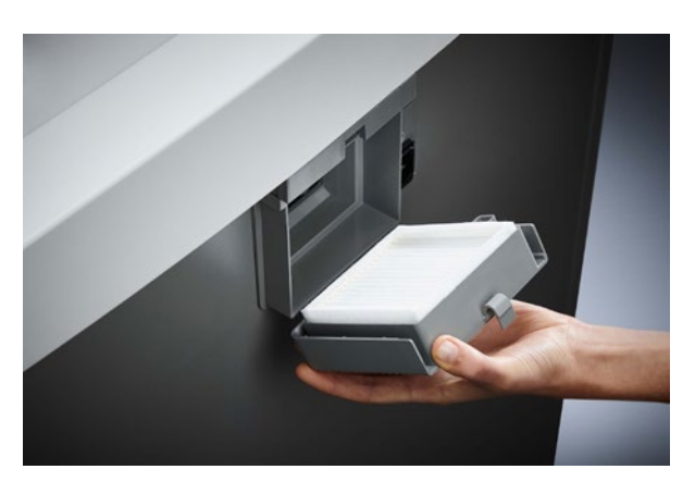
Dahle Office 404air document shredder