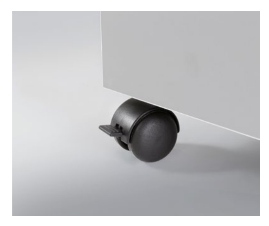
Practical swivel casters for flexible use