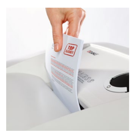
Innovative MHP technology® shreds up to 30 % more paper