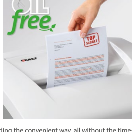
Shredding the convenient way, all without the time-consuming process of oiling the cutters