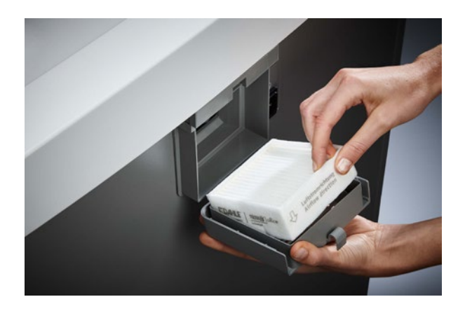
Improved indoor climate even when in heavy use: the unique DAHLE CleanTEC® filter system reduces fine dust pollution from the document shredder