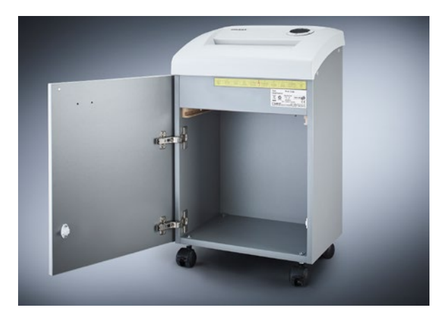
Robust wooden cabinet with doors that open wide to allow easy emptying of document shredder