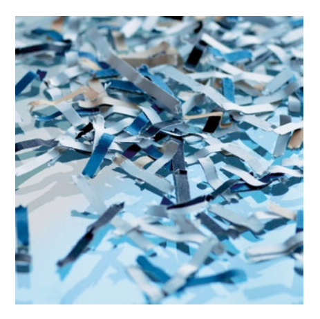
P-4 security: recommended, for example, for data media containing particularly sensitive, confidential and personal data